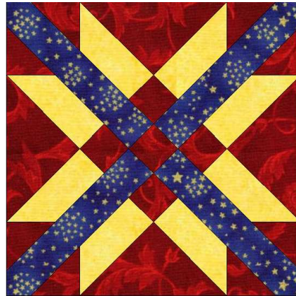
Mexican Star Block Freedom Star Colors